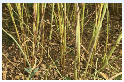
AHDB disease control