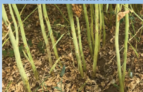
Pi Pinnacle showing clean stems